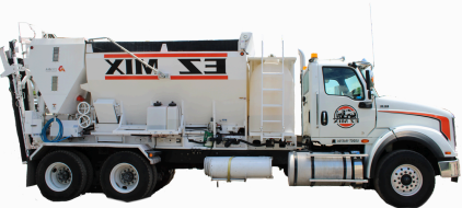
EZ MIX Volumetric Concrete Mixer